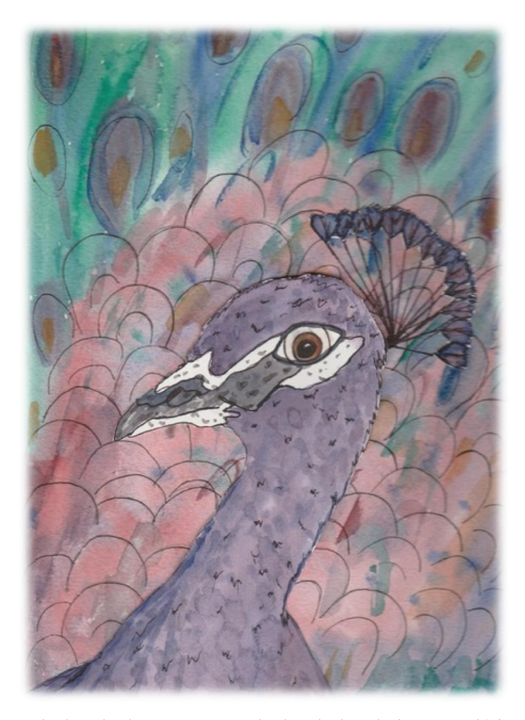
"For the king had at sea a navy of Tharshish with the navy of Hiram: once in three years came the navy of Tharshish, bringing gold, and silver, ivory, and apes, and peacocks. (22) So king Solomon exceeded all the kings of the earth for riches and for wisdom" (1 Kings 10:22).