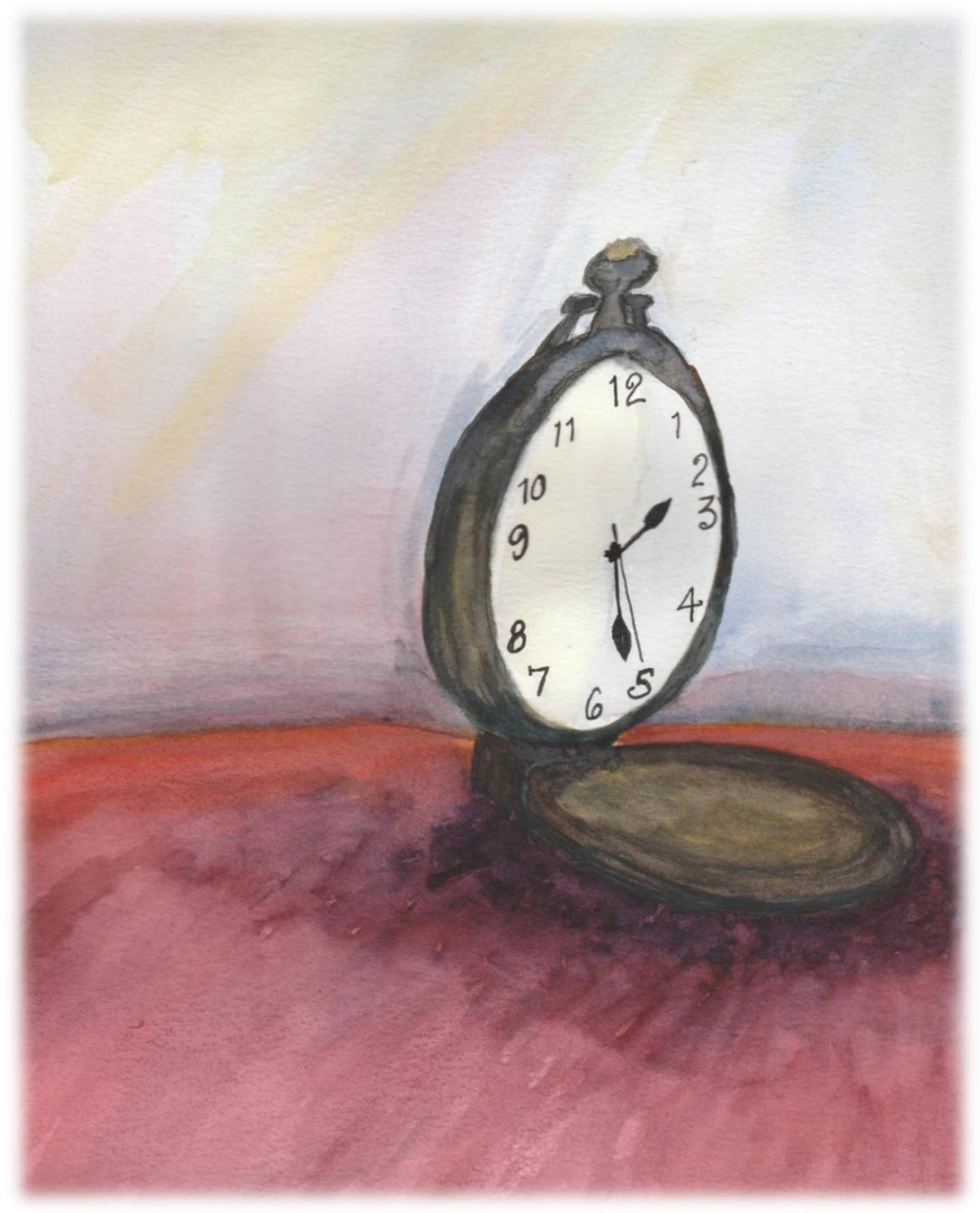
"To every thing there is a season, and a time to every purpose under the heaven:" (Ecclesiastes 3:1).