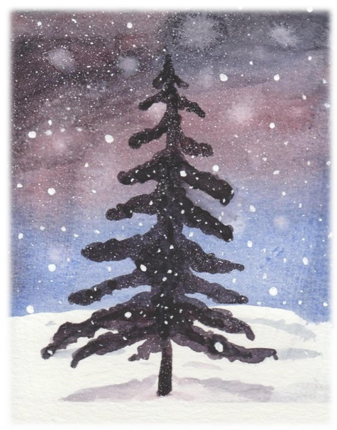
"But when the fulness of the time was come, God sent forth his Son, made of a woman, made under the law, (4) To redeem them that were under the law, that we might receive the adoption of sons" (Galatians 4:4-5).