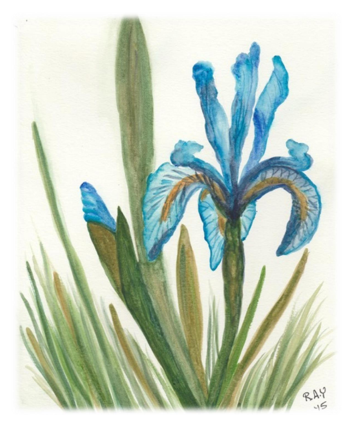
The Greek word for iris means rainbow. "I am the rose of Sharon, A the lily of the valleys." (Song of Solomon 2:1)