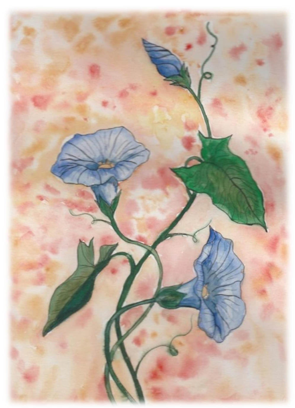
Morning Glories. "For his anger endureth but a moment; in his favour is life: weeping may endure for a night, but joy cometh in the morning." "Awake up, my glory; awake, psaltery and harp: I myself will awake early." (Psalm 30:5; 57:8)