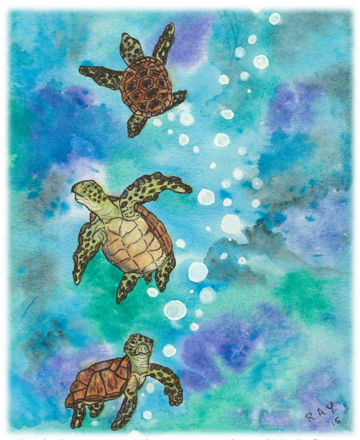
"For, lo, the winter is past, the rain is over and gone; (11) The flowers appear on the earth; the time of the singing of birds is come, and the voice of the turtle is heard in our land;" (Ecclesiastes 2:11,12)